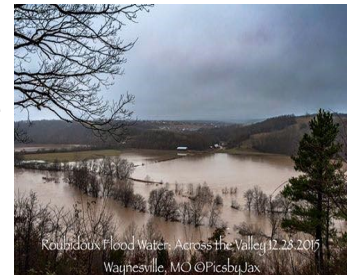
Roubidoux Flood Water Across the Valley 12/28/2015 Waynesville, MO

Our mitigation efforts after the 2013 flood were on display with the flooding of the Parks and the RV area. The City will continue to focus on storm water retention and drainage as money and time allow. As we have no dedicated monies for these efforts, the City uses workers and funds as they are available.