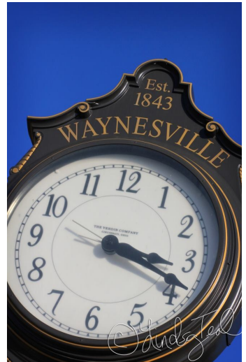
A PURPLE HEART CITY ON THE PURPLE HEART TRAIL!