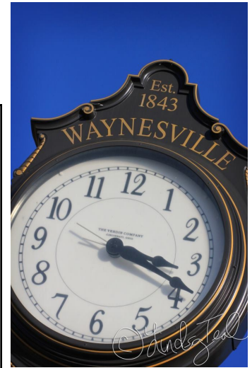
A PURPLE HEART CITY ON THE PURPLE HEART TRAIL!